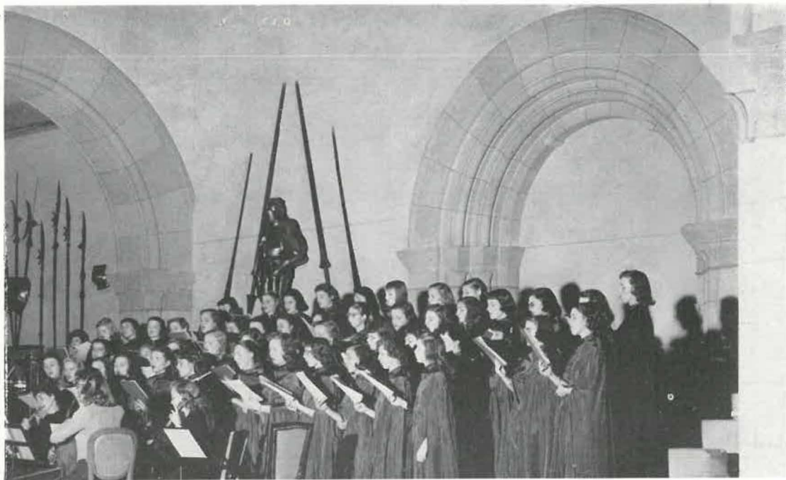
Metropolitan Museum Concert, December 1947