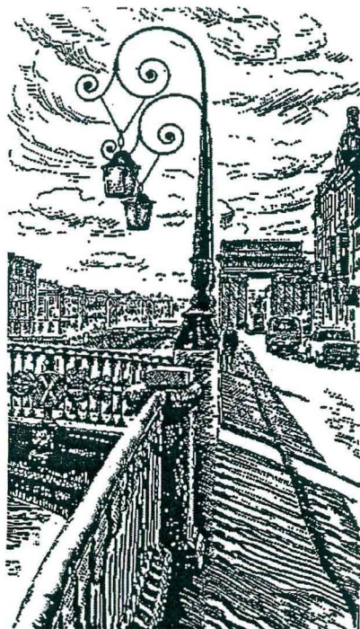
Saturday, December 11, 1999 Deane Carriage Barn Bennington College