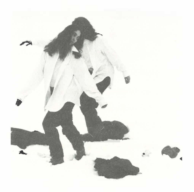
List of present and past collaborators: