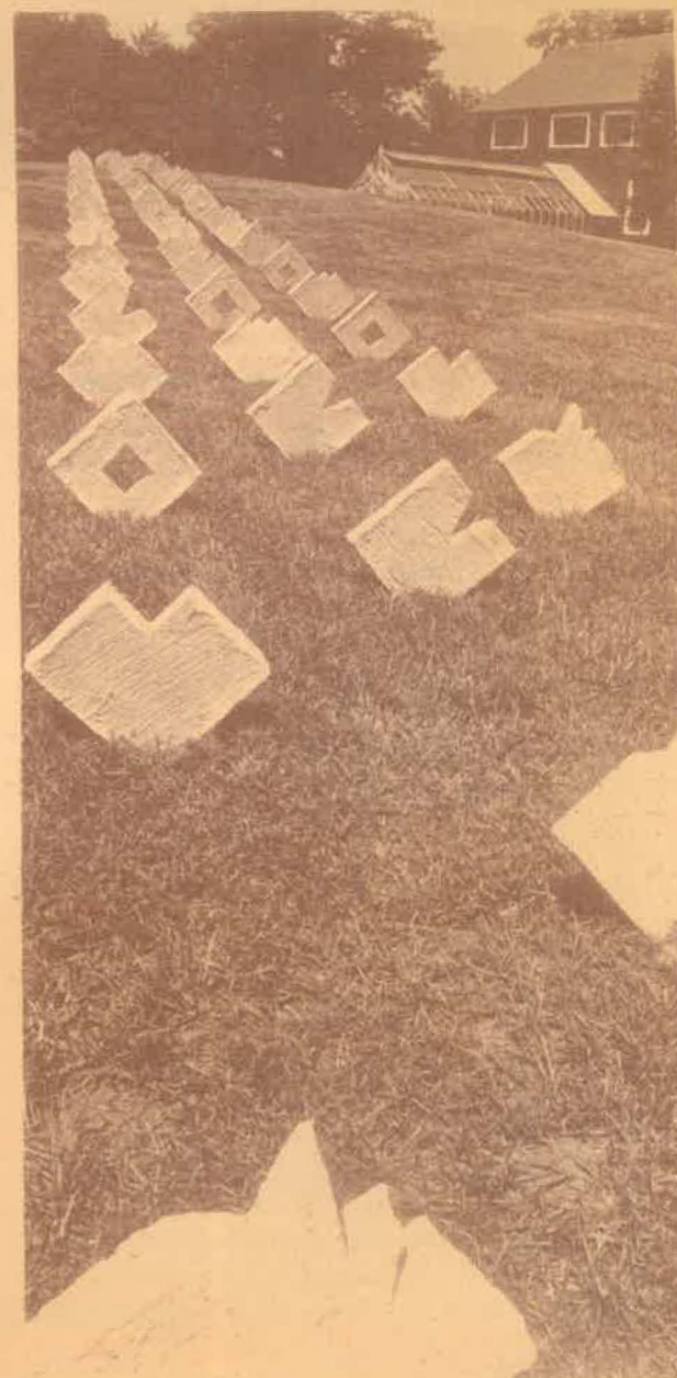
Spontaneous creativity. Page 4.