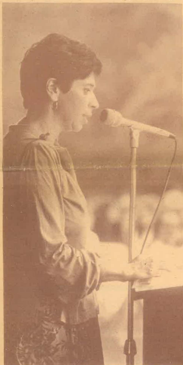
Vivian Gornick. Page 5.