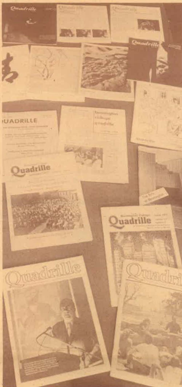
An array of Quadrilles dating back to 1968 (it was the Bennington College Alumnae News before that) shows a wide variety of designs and formats.

As for the name Quadrille , its only meaning lies in its continuity. Literally, it has two dictionary definitions: a square dance of French origin composed of five figures and performed by four couples; or a card game popular during the 18th century played by four people with a deck of 40 cards. It vaguely relates to the number four by its derivation from the Latin and other Romance languages — quadro, cuarto, quatre, et al. And thus we can vaguely link it