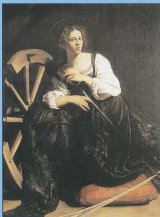
Caravaggio, St. Catherine of Alexandria , 1598