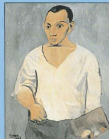
Pablo Picasso Self-Portrait with Palette , 1906

Tishman Lecture Hall • Bennington College • 802-440-4743 • Free and open to the public