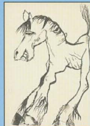
Lucian Freud, Horse Smiling , 1939 Matthew Marks Gallery February 4 – April 12, 2003