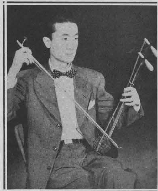
Performed Selections from Chinese Opera April 29