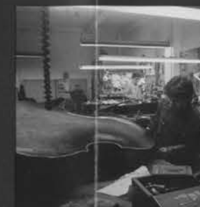
Field Work Term at The Bass Shop

"The FWT was really the deciding factor for me. I wanted to get actual work experience and a good liberal arts education."