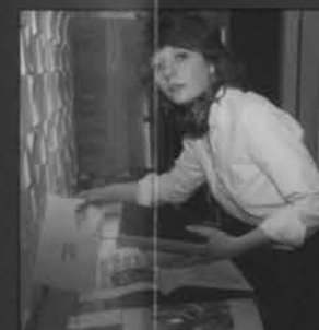
Field Work Term at the Art Directors Club

"The FWT was really the deciding factor for me. I wanted to get actual work experience and a good liberal arts education."