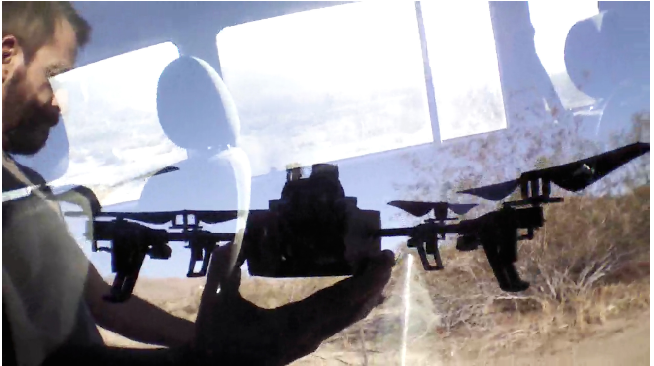
Black Mirror #3 , Matias Viegner