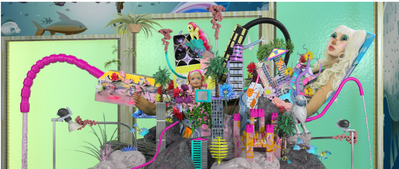
Breathe Deep , Katie Torn, 2014