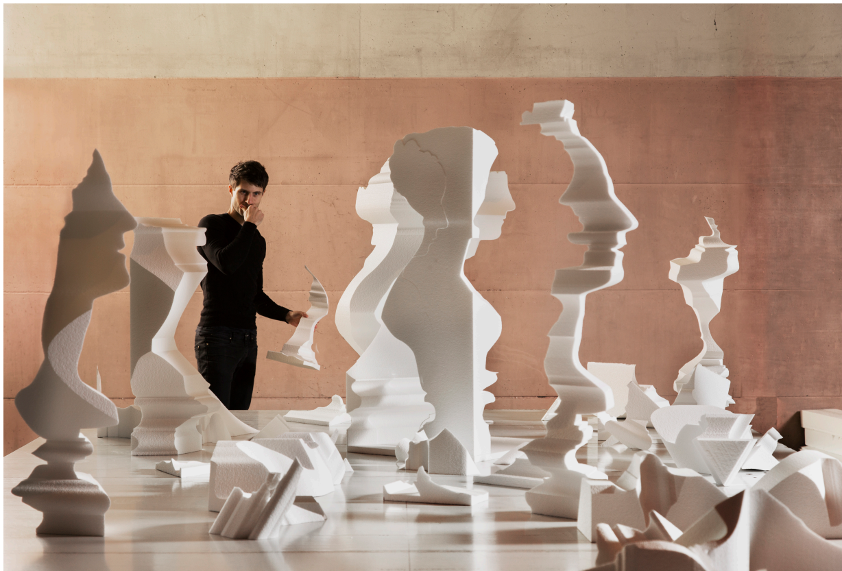
Sometimes I feel like a fire hydrant looking at a pack of dogs (Bill Clinton), Nick Hornby, 2014