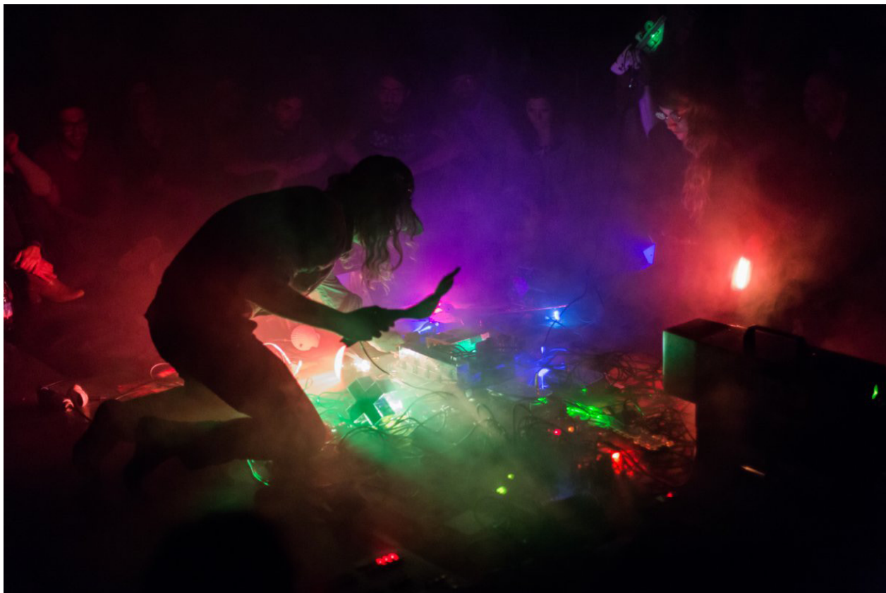
MSHR performing at Live Arts Week, Bologna Italy, 2014