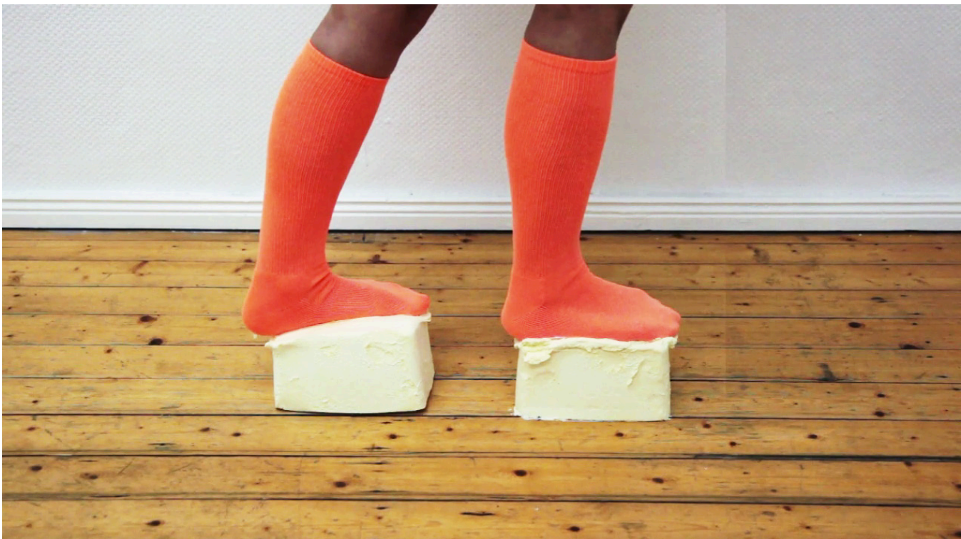
Low Epic , Jaakko Pallasvuo, 2011, video still (not included in Slipped Gears)